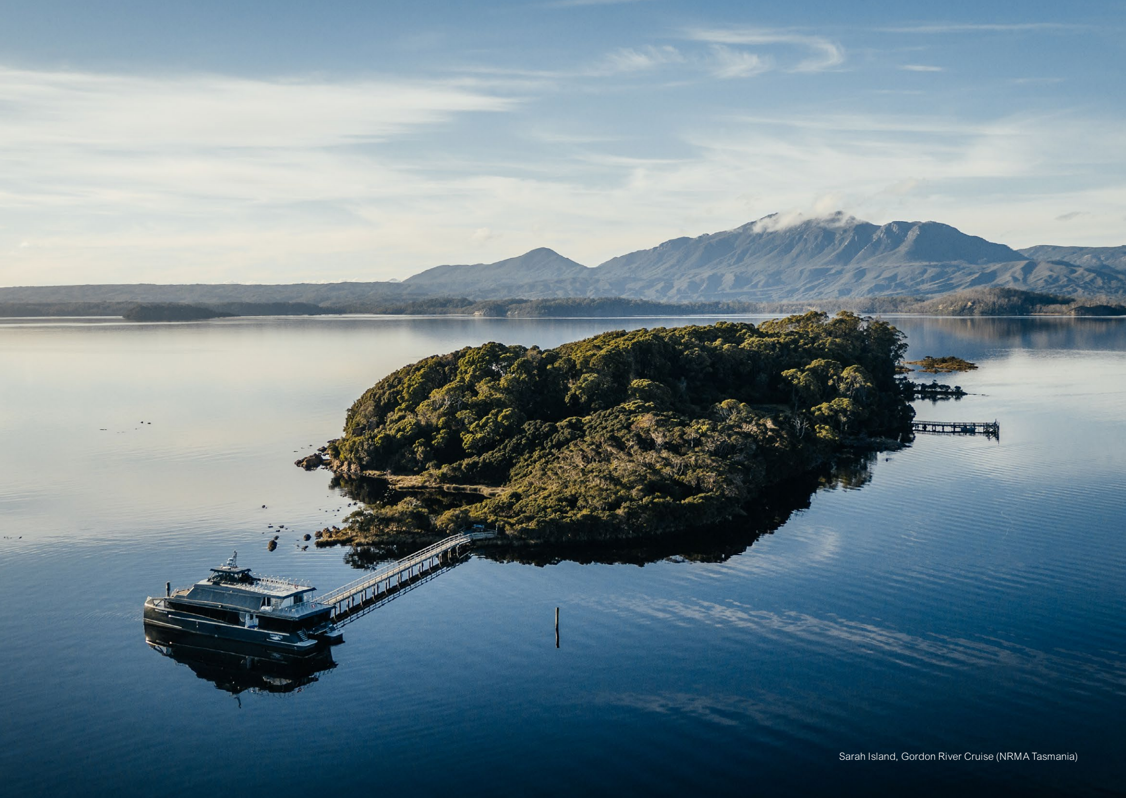
Sarah Island, Gordon River Cruise