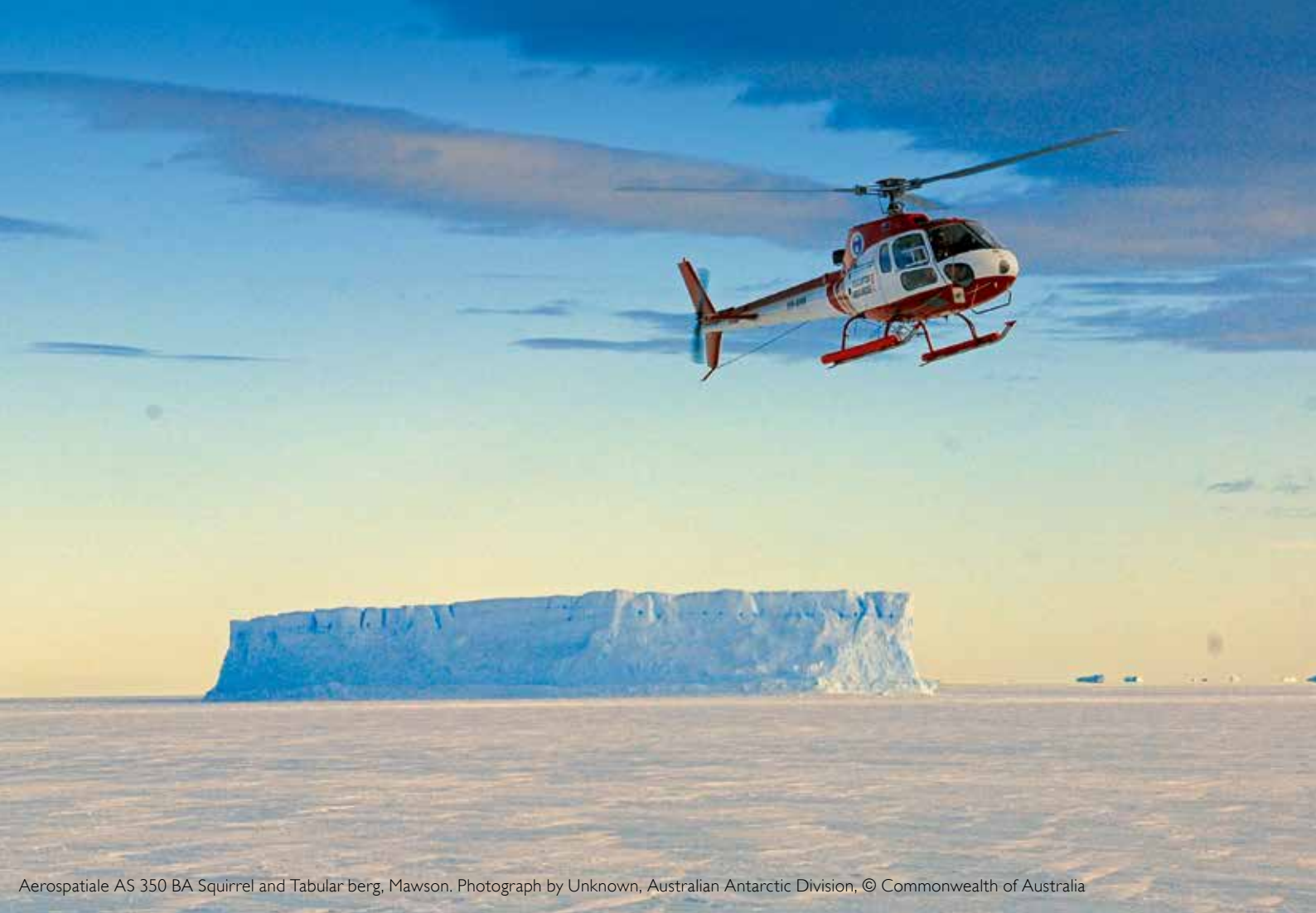
Aerospatiale AS 350 BA Squirrel and Tabular berg, Mawson.