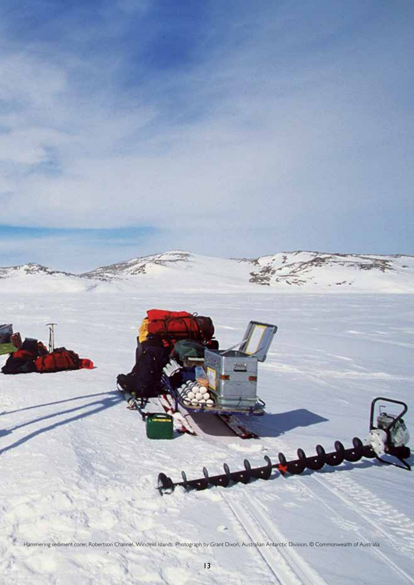
Hammering sediment corer, Robertson Channel, Windmill Islands.